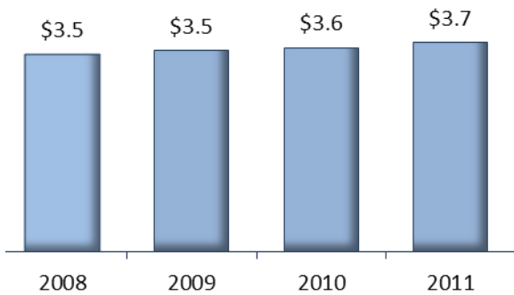
US Exports of Communication Services to EU ($ billion)

Industry Overview: The US communication services sector includes wired, wireless, and satellite telecommunications services, as well as cable subscription services. At $360 billion , the communication services sector accounted for about 2.4 percent of total US GDP in 2011.